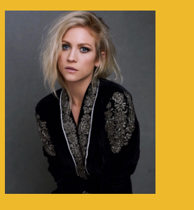
Brittany Snow (Pitch Perfect)