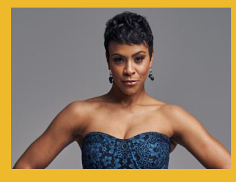
Carly Hughes (ABC's American Housewife)